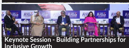
Keynote Session - Building Partnerships for Inclusive Growth