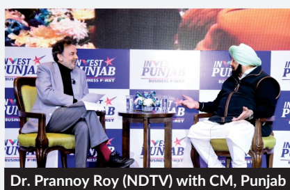
Dr. Prannoy Roy (NDTV) with CM, Punjab