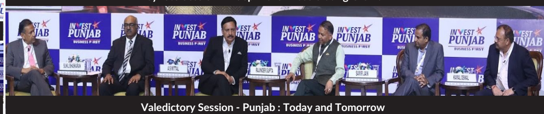
Valedictory Session - Punjab : Today and Tomorrow